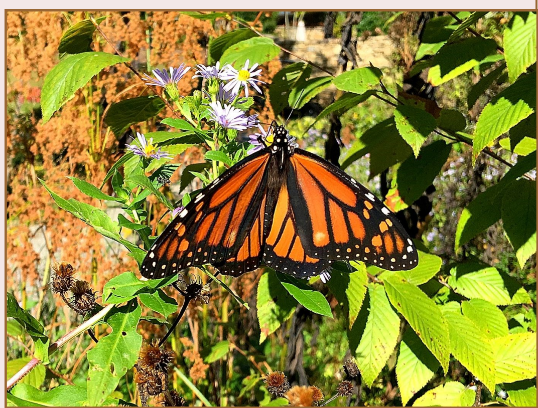
This female monarch butterfly is nectaring on New England aster. While small in volume in terms of nectar production, these flowers provide vital sustenance for monarchs during their long migration to Mexico.

And related directly to that thought is the way autumn is shaping up around the mountains of western North Carolina. I've stated before in this publication that the autumn wildflowers, while maybe prejudiced/ weighted towards the asters, makes them nonetheless, spectacular—and, easier to see, stop and appreciate. Because most of the asters are sun-lovers, they will be found in open fields and along roadsides—which makes driving the Blue Ridge Park-